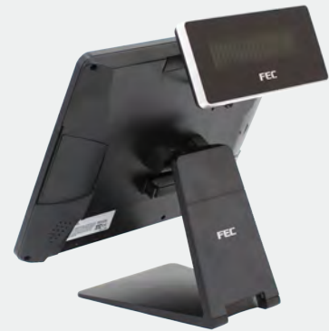
Intergrated Customer Display