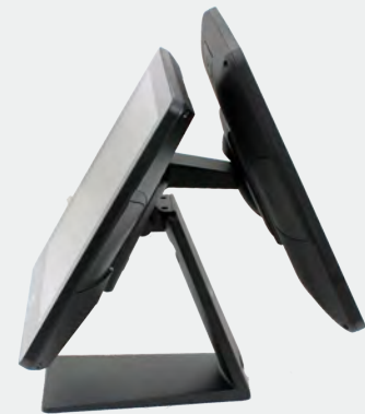
AerArm with 2nd Display