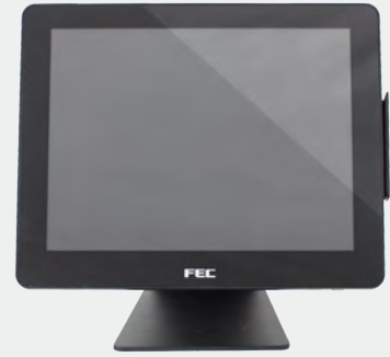
Side USB I/O for Add-on Devices